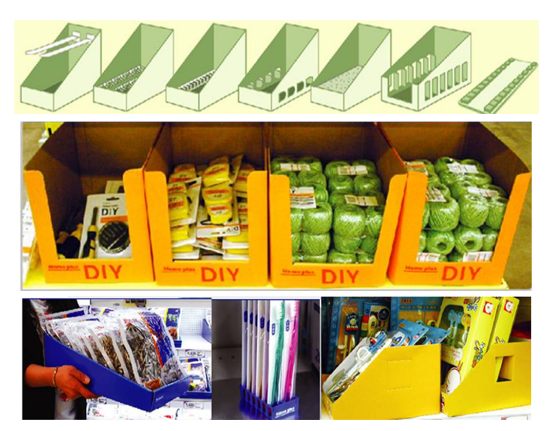
Fig. 1. Example of inner box-type RRP display pattern.

Unlike a product, a service is produced and delivered at the same time, so the interaction between the service provider and the customer at the service contact point has a very important effect on performance<sup>13-14)</sup>. Once the relationship between the firm and the customer is established in the marketplace, continued customer contact, successful interactions and ongoing repeat transactions will enhance the relationship between the service firm and its customer<sup>15)</sup>. Above all, since the main source of competitive advantage is customer value, it is important to secure a competitive advantage in the market so that it can provide customers with perceived value that is higher than that of competitors<sup>15)</sup>. Although the definition of