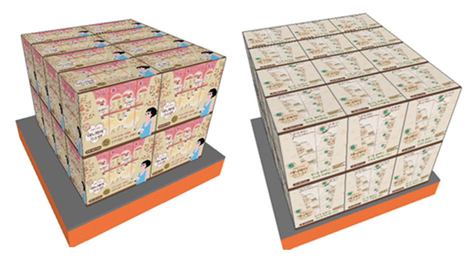
Fig. 2. Outer box-type RRP pattern example.

service quality varies among scholars, they commonly view perceived quality as a customer-oriented concept and an attitude related to facts, expectations, perception, and satisfaction<sup>17-20)</sup>. On the other hand, Parasuraman et al.<sup>21)</sup> defined service quality as an individual's overall judgment or attitude toward the superiority of a specific service, and this definition is commonly cited<sup>22)</sup>. In addition, as a measuring tool for service quality, SERVQUAL of Parasuraman, Zeithaml and Berry<sup>18)</sup> is mainly used, and it has been used in various service industries until now. Reimer and Kuehn<sup>23)</sup> divided the shopping environment into the scale used in Parasuraman et al.<sup>18)</sup>, and Servicescape was seen to include surrounding elements such as music, noise, and temperature, and elements such as the appearance of employees and interiors.